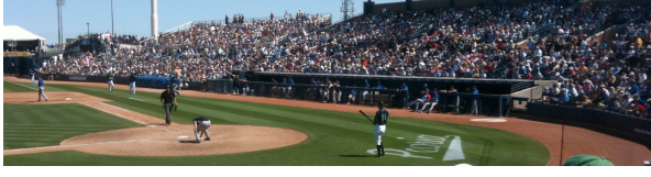
Figure 1: MOKE hysteresis loop for the bi-component Py/Co dots array measured along the dots long axis.

In addition to this, complex periodic arrays of dipolarly coupled magnetic dots are of special interest because they can support the propagation of non-reciprocal spin waves, i.e. \omega(k) \neq \omega(-k) , where \omega is the angular frequency and k is a wave vector, which could find application in the signal transmission and information processing as well as in the design of microwave isolators and circulators.