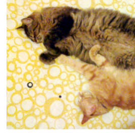
Figure 2: MFM images of the bi-component Py/Co dots for different values of the applied magnetic field which are indicated by greek letters along both the major and minor hysteresis loop.

To directly visualize the evolution of the magnetization in the Py and Co subunits of our bi-component dots during the reversal process, we performed a field-dependent MFM analysis whose main results are reported in Fig. 2. At large positive field ( H = +800 Oe, not shown here) and at remanence ( \alpha point of the hysteresis loop of Fig. 1), the structures are characterized by a strong dipolar contrast due to the stray fields emanated from both the Py and Co dots.