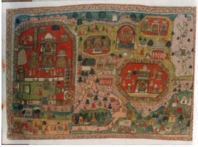
Figure 6: Calculated frequency evolution of modes detected in the BLS spectra.

In Fig. 6 the calculated frequencies of the most representative eigenmodes at +500 Oe (FM state) and − 500 Oe (AP state) are plotted as a function of the gap size d between the Py and Co sub units (please remind that in the real sample studied here, d = 35 nm). As a general comment, it can be seen that the frequencies for the system in the AP state are more sensitive to d than those of the P state. In particular, the lowest three frequency modes of the AP state (EM(Co), EM(Py) and F(Py)) are downshifted with respect to the case of isolated elements (dotted lines) and show a marked decrease with reducing d , while the two modes at higher frequencies (F(Co) and IDE(Py)) have an opposite behavior even though they exhibit a reduced amplitude. In the P state (right panel), the modes concentrated into the Py dots exhibit a moderate decrease with reducing d , while an opposite but less pronounced behavior is exhibited by the F(Co) mode.