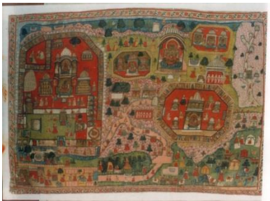
Figure 6: Calculated frequency evolution of modes detected in the BLS spectra.

In Fig. 6 the calculated frequencies of the most representative eigenmodes at +500 Oe (FM state) and − 500 Oe (AP state) are plotted as a function of the gap size d between the Py and Co sub units (please remind that in the real sample studied here, d = 35 nm). As a general comment, it can be seen that the frequencies for the system in the AP state are more sensitive to d than those of the P state. In particular, the lowest three frequency modes of the AP state (EM(Co), EM(Py) and F(Py)) are downshifted with respect to the case of isolated elements (dotted lines) and show a marked decrease with reducing d , while the two modes at higher frequencies (F(Co) and IDE(Py)) have an opposite behavior even though they exhibit a reduced amplitude. In the P state (right panel), the modes concentrated into the Py dots exhibit a moderate decrease with reducing d , while an opposite but less pronounced behavior is exhibited by the F(Co) mode.