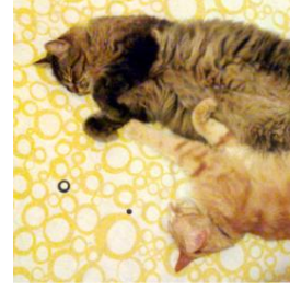
Figure 2: MFM images of the bi-component Py/Co dots for different values of the applied magnetic field which are indicated by greek letters along both the major and minor hysteresis loop.

To directly visualize the evolution of the magnetization in the Py and Co subunits of our bi-component dots during the reversal process, we performed a field-dependent MFM analysis whose main results are reported in Fig. 2. At large positive field ( H = +800 Oe, not shown here) and at remanence ( \alpha point of the hysteresis loop of Fig. 1), the structures are characterized by a strong dipolar contrast due to the stray fields emanated from both the Py and Co dots.