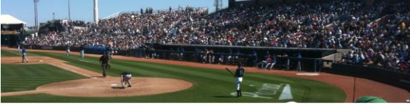
Figure 1: MOKE hysteresis loop for the bi-component Py/Co dots array measured along the dots long axis.

In addition to this, complex periodic arrays of dipolarly coupled magnetic dots are of special interest because they can support the propagation of non-reciprocal spin waves, i.e. (\omega(k) \neq \omega(-k)) , where \omega is the angular frequency and k is a wave vector, which could find application in the signal transmission and information processing as well as in the design of microwave isolators and circulators.