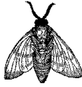
Figure 2: A sample black and white graphic that has been resized with the includegraphics command.

It is also a good idea not to overuse horizontal rules.